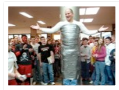
Students from Pinckney HS cheer as they duct tape their principal to a pole for a fundraiser to benefit Alternatives in Motion.

"Thank you for your generosity with these chairs! What you are doing for people that have mobility restrictions is life-altering. From being confined to a place to having the freedom to live, be and do-its an incredible experience. Even if my restriction is only temporary, it certainly gave me a chance to see the world through someone else's eyes. Thank you for your help, it is much appreciated! I know that when MASC/MAHS works with Alternatives in Motion, good things are happening for people all over Michigan-we are helping them LIVE IN MOTION!"