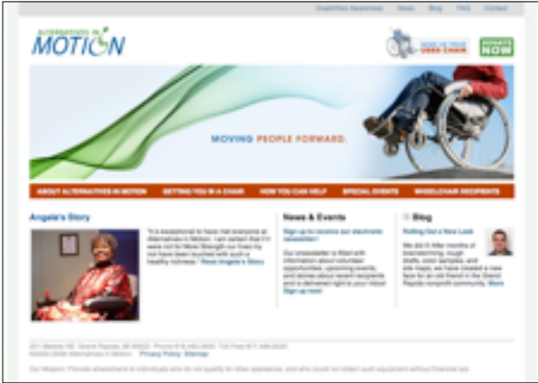
Log on: www.alternativesinmotion.org